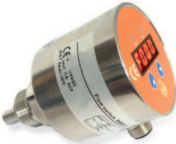
digital display flow switch MODEL: DFSL-DI-03 Series technical parameter:

G1/2 thread; probe length 15mm; power supply 24VDC; output signal: 2 relays and 4-20mA accessories:2m cable length