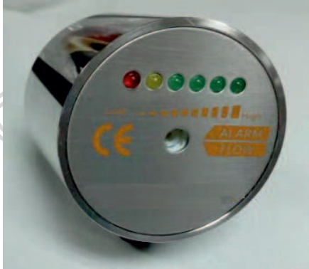
6 LED indicator flow switch MODEL: DFSL-D-03 Series technical parameter:

G1/2 thread; probe length 15mm; power supply 24VDC; relay output accessories:M12 connector